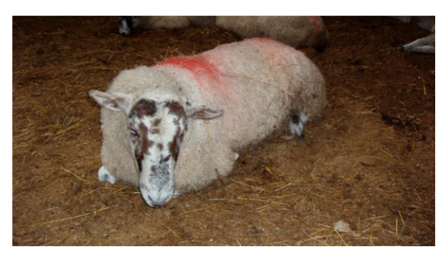
Botulism affected ewe in sternal recumbency