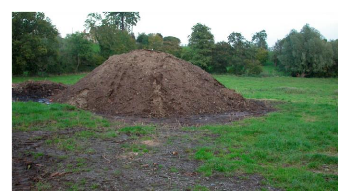
Broiler manure on field awaiting spreading

Chicken litter is usually brought onto farmland as a source of fertiliser. Animals have become affected through direct access to litter when it has been heaped or spread in the field where they are grazing, and indirectly from litter on a neighbour's premises, possibly as the result of carcase movement by scavenging birds and animals. Windy weather is also thought to be implicated in some outbreaks by spreading contaminated dust. Occasional cases have also occurred in animals fed silage made from fields fertilised with broiler litter.