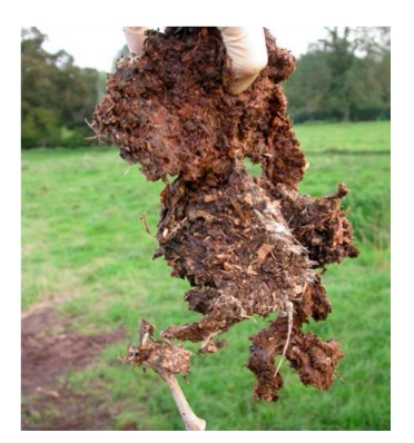
Chicken carcase remains found in broiler manure